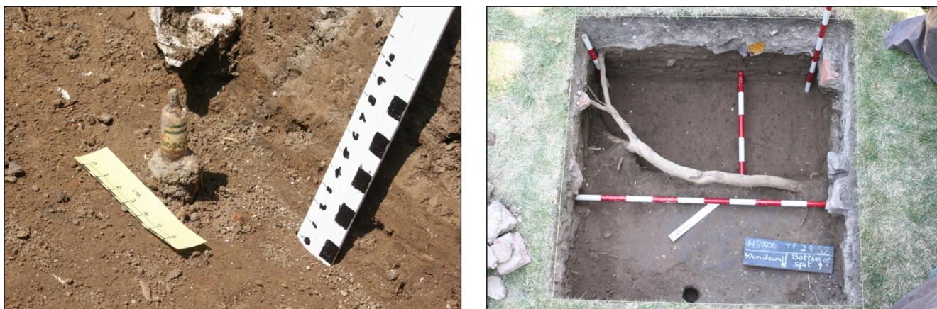
Figs 3: Spark plug in situ and 'washing pole' hole after excavation.

plug inscribed Bosch Germany and also positioned vertically ( Fig 3 ). Directly below this at 40cm a small circular pit of 6cm diameter was discovered, loosely filled with fragments of building material. This was excavated to a depth of 13cm, the narrowness of the pit preventing deeper excavation.