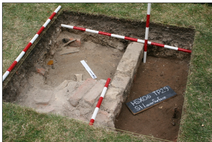
Fig 2: Surface at the base of Spit 1.

The topsoil in the pit was fine-grained and consisted of clay with high ash content. At a depth of 15cm this became mixed with a large proportion of mortar, beneath which a wall was discovered running the whole width of the pit from north to south (see Fig 2 ). To the east of the wall was found a quantity of bricks, fireplace tiles and sections of a fireback. To the west of the wall from a depth of 20cm, beneath a building materials layer corresponding to the level of the walls, the soil changed to a light brown, firm, silty clay with a lot of flint inclusions. Once the wall and building rubble had been carefully recorded they were removed and the soil beneath them was found to be the same silty clay as just described above. The wall consisted of two courses of bricks of various shapes and sizes.