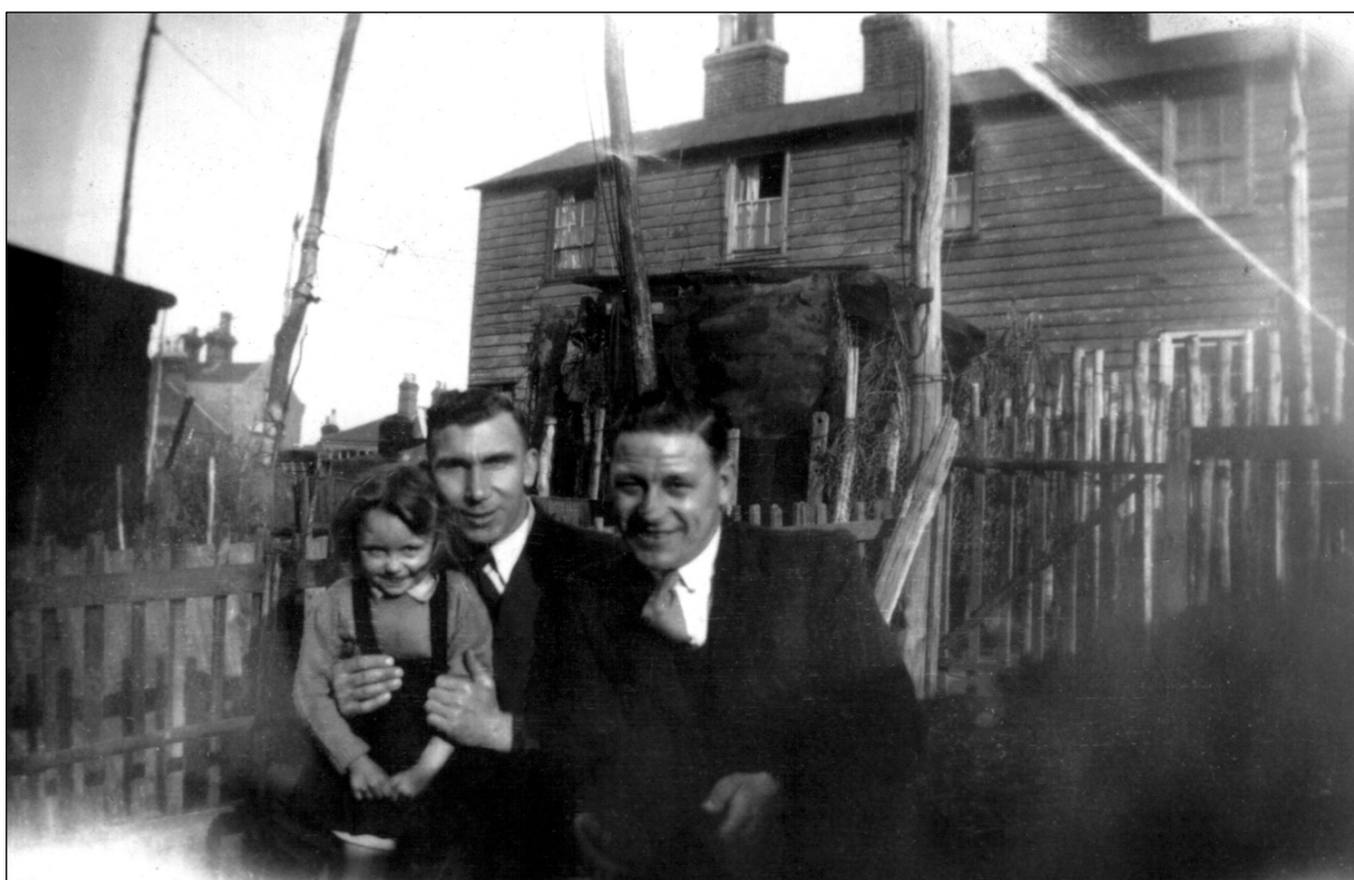
Fig 4: Garden Place cottages not long before demolition in the 1950s.

The wall is no doubt part of the front wall of the cottage in Garden Place. It directly matches the position and alignment of the wall as shown in the maps. This is further backed up by the fact that the fireplace debris and the gas mantle fitting were found where the inside of the house would have been. Sydney Bushnell, a local resident of long standing who supplied the unique photograph in Fig 4 , told us the houses never had electricity so the gas fitting is especially poignant. The wall was of poor quality, constructed of ill-assorted bricks, but would have been substantial enough to support the small weather-boarded cottage for a century. The objects found above the level of the wall such as the coin and the pottery can for the most part be dated to the period of the occupation of the building.